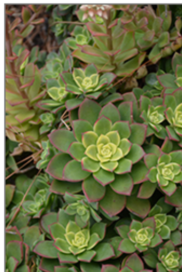
Kiwi Aeonium foliage

Kiwi Aeonium is a fine choice for the garden, but it is also a good selection for planting in outdoor pots and containers. Because of its spreading habit of growth, it is ideally suited for use as a 'spiller' in the 'spiller-thriller-filler' container combination; plant it near the edges where it can spill gracefully over the pot. Note that when growing plants in outdoor containers and baskets, they may require more frequent waterings than they would in the yard or garden.