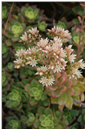
Kiwi Aeonium flowers