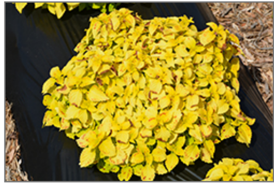
Terra Nova Pepperpot Coleus

Terra Nova Pepperpot Coleus is recommended for the following landscape applications;