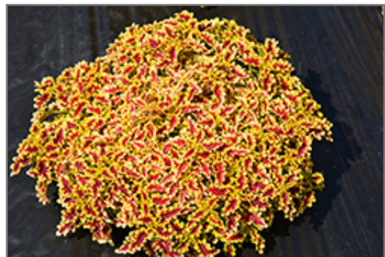
Terra Nova Lovebird Coleus