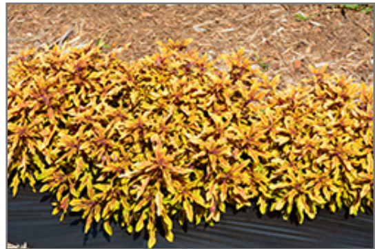
Hipsters Zooley Coleus