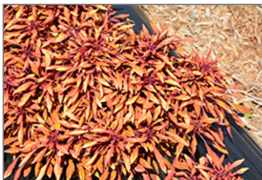
Fancy Feathers Copper Coleus