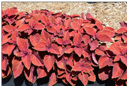
Color Clouds Valentine Coleus