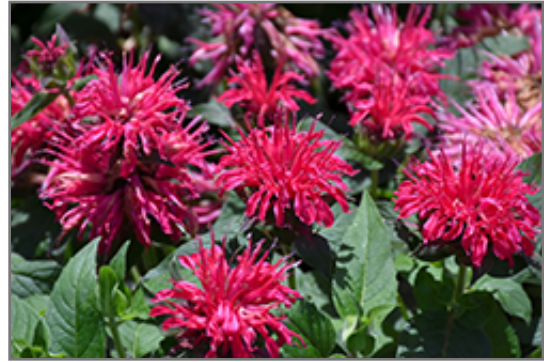
Balmy Rose Beebalm flowers