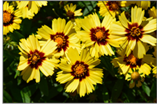
UpTick Yellow and Red Tickseed flowers

UpTick Yellow and Red Tickseed is recommended for the following landscape applications;