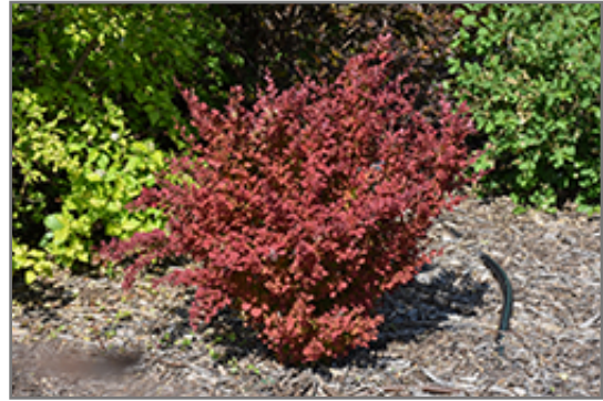
First Editions Toscana Barberry

First Editions Toscana Barberry is recommended for the following landscape applications;