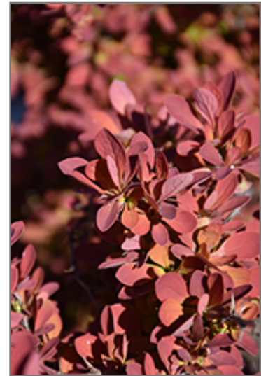
First Editions Toscana Barberry foliage