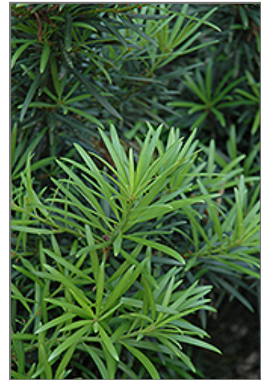
Japanese Yew foliage

When grown indoors, Japanese Yew can be expected to grow to be about 6 feet tall at maturity, with a spread of 3 feet. It grows at a slow rate, and under ideal conditions can be expected to live for approximately 50 years. This houseplant will do well in a location that gets either direct or indirect sunlight, although it will usually require a more brightly-lit environment than what artificial indoor lighting alone can provide. It does best in average to evenly moist soil, but will not tolerate standing water. The surface of the soil shouldn't be allowed to dry out completely, and so you should expect to water this plant once and possibly even twice each week. Be aware that your particular watering schedule may vary depending on its location in the room, the pot size, plant size and other conditions; if in doubt, ask one of our experts in the store for advice. It is not particular as to soil type or pH; an average potting soil should work just fine.