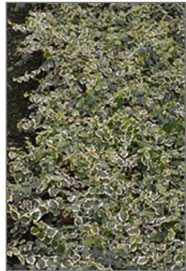
Variegated Creeping Fig in full