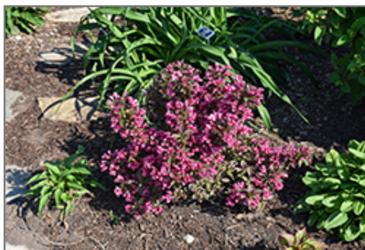
Minor Black Weigela in bloom