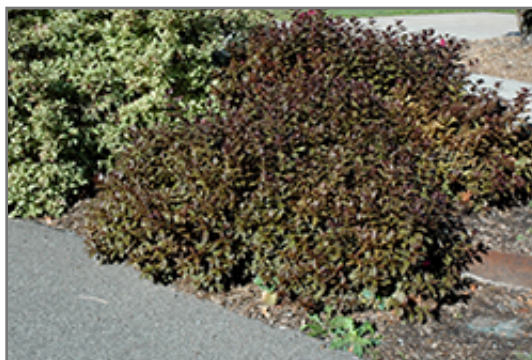
Minor Black Weigela

This shrub should only be grown in full sunlight. It prefers to grow in average to moist conditions, and shouldn't be allowed to dry out. It may require supplemental watering during periods of drought or extended heat. It is not particular as to soil type or pH. It is highly tolerant of urban pollution and will even thrive in inner city environments. This is a selected variety of a species not originally from North America.