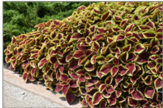
Crimson Gold Coleus