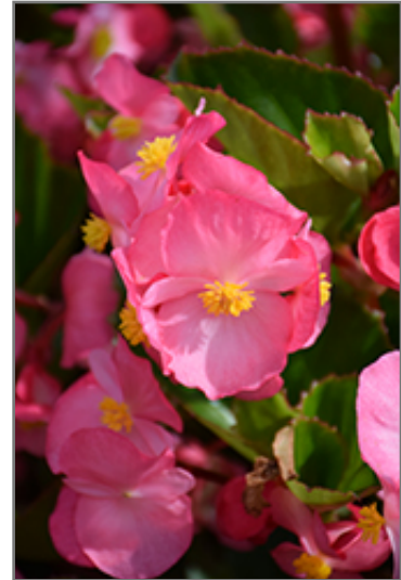
Big Pink Green Leaf Begonia flowers

This is a high maintenance plant that will require regular care and upkeep, and usually looks its best without pruning, although it will tolerate pruning. Deer don't particularly care for this plant and will usually leave it alone in favor of tastier treats. Gardeners should be aware of the following characteristic(s) that may warrant special consideration;