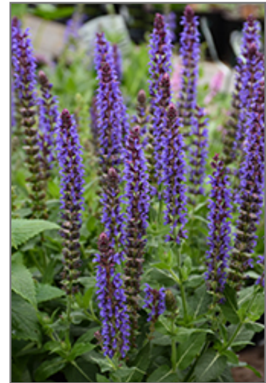
Violet Riot Sage flowers

Violet Riot Sage is recommended for the following landscape applications;