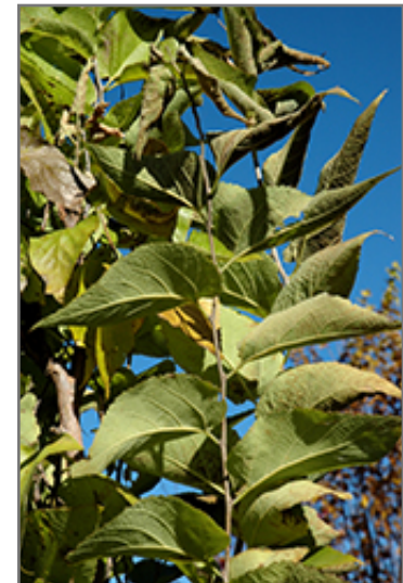
Prairie Sentinel Hackberry foliage

Moana Lane Garden Center & Corporate Office 1100 W. Moana Lane Reno, NV 89509 (775) 825-0600 (775) 825-0602 - Corporate Office