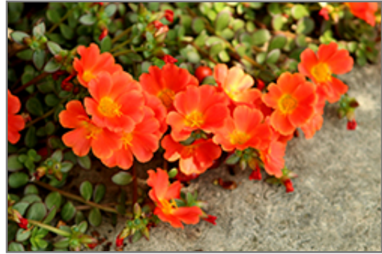
RioGrande Orange Portulaca flowers

RioGrande Orange Portulaca is recommended for the following landscape applications;