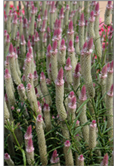
Flamingo Feather Celosia foliage

Flamingo Feather Celosia is recommended for the following landscape applications;