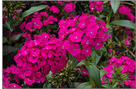
Amazon Neon Purple Pinks flowers

Amazon Neon Purple Pinks is recommended for the following landscape applications;