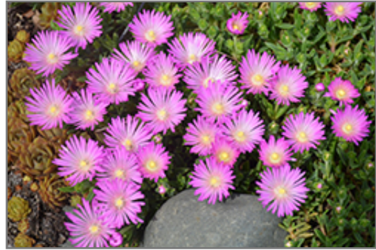
Table Mountain Ice Plant flowers

Table Mountain Ice Plant is recommended for the following landscape applications;