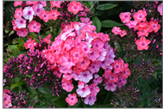
Glamour Girl Garden Phlox flowers