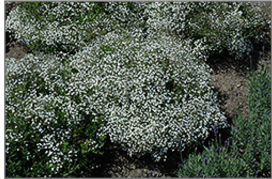
Summer Sparkles Baby's Breath in bloom

This plant should only be grown in full sunlight. It prefers dry to average moisture levels with very well-drained soil, and will often die in standing water. It is considered to be drought-tolerant, and thus makes an ideal choice for a low-water garden or xeriscape application. It is not particular as to soil type, but has a definite preference for alkaline soils, and is able to handle environmental salt. It is highly tolerant of urban pollution and will even thrive in inner city environments. This is a selected variety of a species not originally from North America.