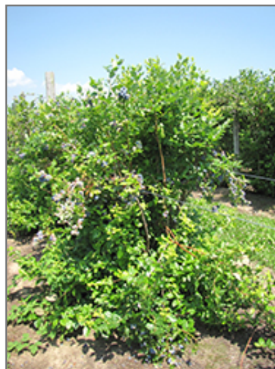
Duke Blueberry fruit

This shrub is typically grown in a designated area of the yard because of its mature size and spread. It does best in full sun to partial shade. It does best in average to evenly moist conditions, but will not tolerate standing water. It may require supplemental watering during periods of drought or extended heat. It is very fussy about its soil conditions and must have sandy, acidic soils to ensure success, and is subject to chlorosis (yellowing) of the foliage in alkaline soils. It is quite intolerant of urban pollution, therefore inner city or urban streetside plantings are best avoided, and will benefit from being planted in a relatively sheltered location. Consider applying a thick mulch around the root zone in both summer and winter to conserve soil moisture and protect it in exposed locations or colder microclimates. This is a selection of a native North American species.