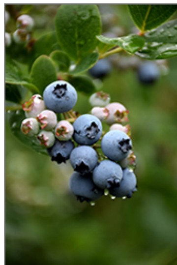
Duke Blueberry fruit

Duke Blueberry features dainty clusters of white bell-shaped flowers with shell pink overtones hanging below the branches in mid spring. It has green deciduous foliage. The glossy oval leaves turn an outstanding orange in the fall. It features an abundance of magnificent blue berries in mid summer. The smooth yellow bark adds an interesting dimension to the landscape.