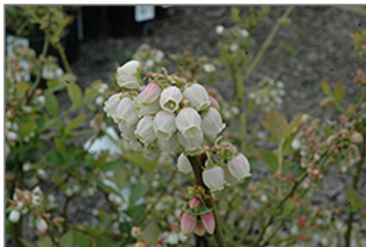
Duke Blueberry flowers