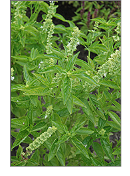
Sweet Italian Basil flowers

Landscape Services & Design Center 1190 W. Moana Lane Reno, NV 89509 (775) 825-0602 ext. 134 NV Lic. #3379A, D & CA Lic. #317448