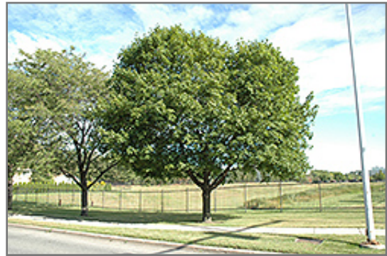
Norway Maple