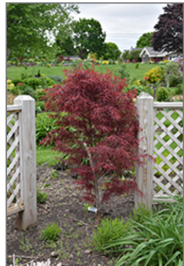
Hubb's Red Willow Japanese Maple