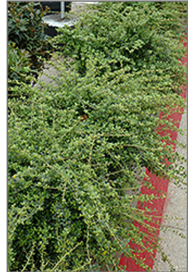
Helleri Japanese Holly

This shrub does best in full sun to partial shade. It prefers to grow in average to moist conditions, and shouldn't be allowed to dry out. It may require supplemental watering during periods of drought or extended heat. It is very fussy about its soil conditions and must have rich, acidic soils to ensure success, and is subject to chlorosis (yellowing) of the foliage in alkaline soils. It is highly tolerant of urban pollution and will even thrive in inner city environments. Consider applying a thick mulch around the root zone in winter to protect it in exposed locations or colder microclimates. This is a selected variety of a species not originally from North America.