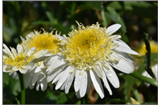
Realflor Real Glory Shasta Daisy flowers

Realflor Real Glory Shasta Daisy is recommended for the following landscape applications;