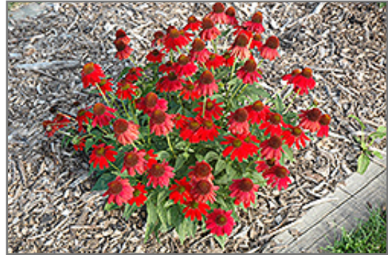
Sombrero Salsa Red Coneflower in bloom

Sombrero Salsa Red Coneflower will grow to be about 16 inches tall at maturity extending to 24 inches tall with the flowers, with a spread of 24 inches. Its foliage tends to remain dense right to the ground, not requiring facer plants in front. It grows at a medium rate, and under ideal conditions can be expected to live for approximately 10 years. As an herbaceous perennial, this plant will usually die back to the crown each winter, and will regrow from the base each spring. Be careful not to disturb the crown in late winter when it may not be readily seen!