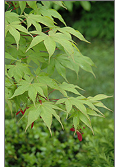
Osakazuki Japanese Maple foliage

This tree does best in partial shade to full shade. Keep it well away from hot, dry locations that receive direct afternoon sun or which get reflected sunlight, such as against the south side of a white wall. It prefers to grow in average to moist conditions, and shouldn't be allowed to dry out. It may require supplemental watering during periods of drought or extended heat. It is not particular as to soil pH, but grows best in rich soils. It is somewhat tolerant of urban pollution, and will benefit from being planted in a relatively sheltered location. Consider applying a thick mulch around the root zone in both summer and winter to conserve soil moisture and protect it in exposed locations or colder microclimates. This is a selected variety of a species not originally from North America.