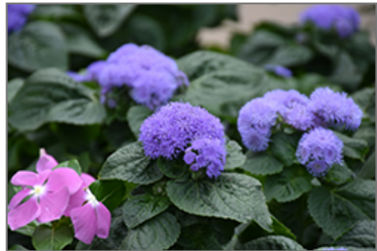
High Tide Blue Flossflower flowers

Moana Lane Garden Center & Corporate Office 1100 W. Moana Lane Reno, NV 89509 (775) 825-0600 (775) 825-0602 - Corporate Office