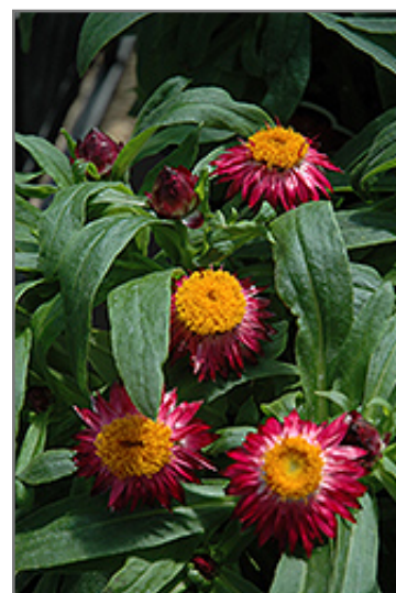
Mohave Dark Red Strawflower flowers