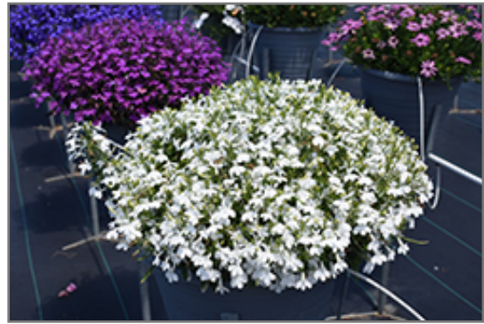
Techno Upright White Lobelia in bloom

Techno Upright White Lobelia will grow to be about 10 inches tall at maturity, with a spread of 12 inches. When grown in masses or used as a bedding plant, individual plants should be spaced approximately 10 inches apart. Its foliage tends to remain low and dense right to the ground. Although it's not a true annual, this fast-growing plant can be expected to behave as an annual in our climate if left outdoors over the winter, usually needing replacement the following year. As such, gardeners should take into consideration that it will perform differently than it would in its native habitat.