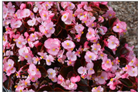
Nightlife Pink Begonia flowers