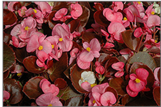
Nightife Rose Begonia flowers

Nightife Rose Begonia is recommended for the following landscape applications;