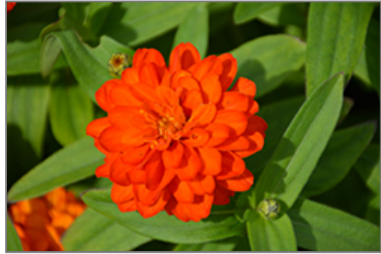
Profusion Double Fire Zinnia flowers