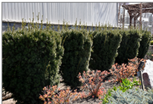
Hicks Yew

This shrub does best in partial shade to full shade. Keep it well away from hot, dry locations that receive direct afternoon sun or which get reflected sunlight, such as against the south side of a white wall. It does best in average to evenly moist conditions, but will not tolerate standing water. It may require supplemental watering during periods of drought or extended heat. It is not particular as to soil type or pH. It is highly tolerant of urban pollution and will even thrive in inner city environments, and will benefit from being planted in a relatively sheltered location. Consider applying a thick mulch around the root zone in both summer and winter to conserve soil moisture and protect it in exposed locations or colder microclimates. This particular variety is an interspecific hybrid, and parts of it are known to be toxic to humans and animals, so care should be exercised in planting it around children and pets.