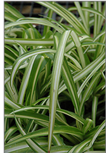
Spider Plant foliage

When grown indoors, Spider Plant can be expected to grow to be about 24 inches tall at maturity, with a spread of 24 inches. It grows at a medium rate, and under ideal conditions can be expected to live for approximately 10 years. This houseplant performs well in both bright or indirect sunlight and strong artificial light, and can therefore be situated in almost any well-lit room or location. It is very adaptable to both dry and moist soil, but will not tolerate any standing water. The surface of the soil shouldn't be allowed to dry out completely, and so you should expect to water this plant once and possibly even twice each week. Be aware that your particular watering schedule may vary depending on its location in the room, the pot size, plant size and other conditions; if in doubt, ask one of our experts in the store for advice. It is not particular as to soil type or pH; an average potting soil should work just fine.