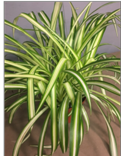
Beautiful Spider Plant