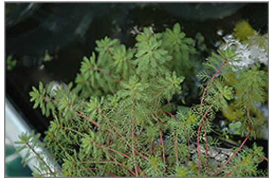
Red Stemmed Parrot Feather foliage