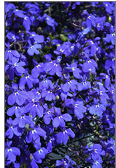
Techno Heat Blue Lobelia flowers