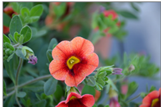
Celebration Mandarin Calibrachoa flowers