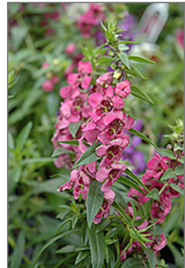
Pink Angelonia flowers