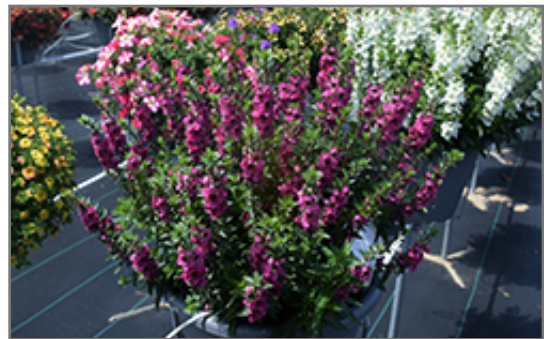
Archangel Raspberry Angelonia in bloom