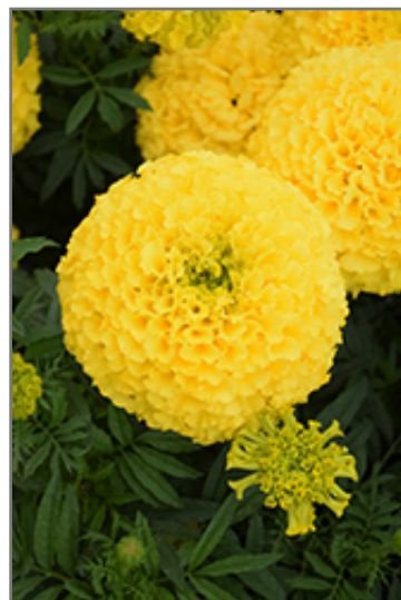
Marvel Yellow Marigold flowers

Marvel Yellow Marigold is recommended for the following landscape applications;