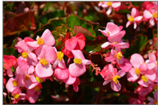
BabyWing Pink Begonia flowers

BabyWing Pink Begonia is recommended for the following landscape applications;