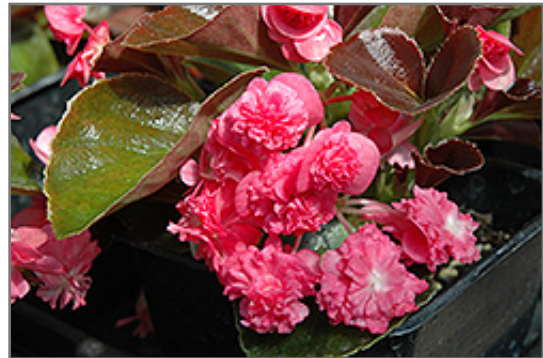
Doublet Rose Begonia flowers