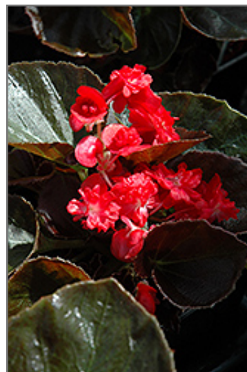
Doublet Red Begonia flowers