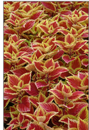
Trusty Rusty Coleus foliage

Moana Lane Garden Center & Corporate Office 1100 W. Moana Lane Reno, NV 89509 (775) 825-0600 (775) 825-0602 - Corporate Office