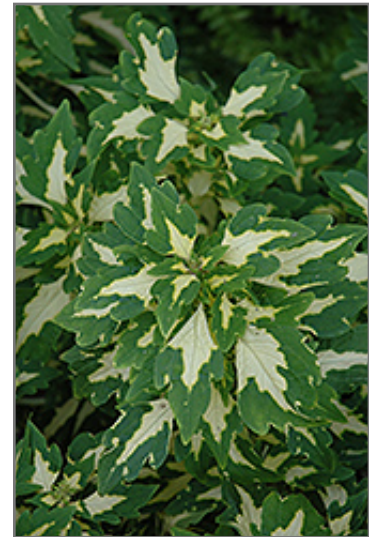
ColorBlaze Alligator Tears Coleus foliage