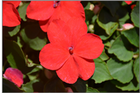
Super Elfin XP Melon Impatiens in bloom

Super Elfin XP Melon Impatiens is recommended for the following landscape applications;